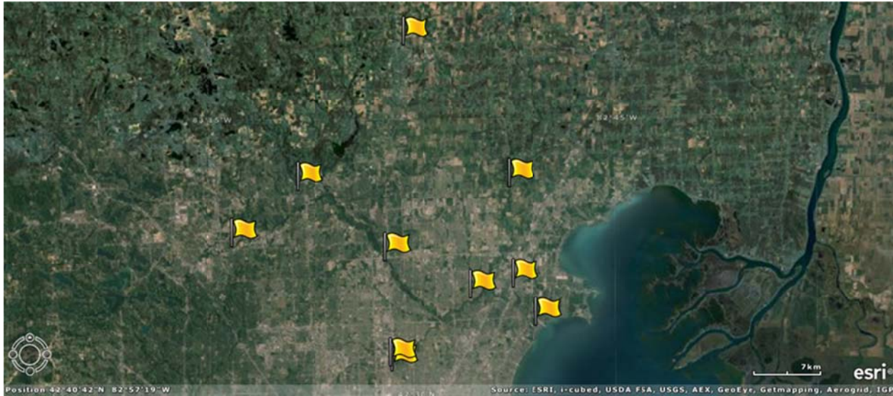
Figure 2. Clinton River Aesthetics Monitoring Locations.

During the November 16, 2011 assessment, additional photographs of the landfill area were taken showing a six to eight foot vertical wall of landfill debris sloughing into the river (Figure 3). The debris found in the immediate area included: car bodies, a transmission, a motorcycle frame, a clothes dryer, scores of tires, glass bottles, plastic toys, bicycle parts, plastic bags, wood debris, and other various forms of trash. In terms of water quality, discolored water was observed seeping out of the exposed river bank and into the river (Figure 4). However, surface samples of river water that were collected adjacent to the site did not exhibit unnatural color, but petroleum odors were present, as were oily sheens and biofilms.