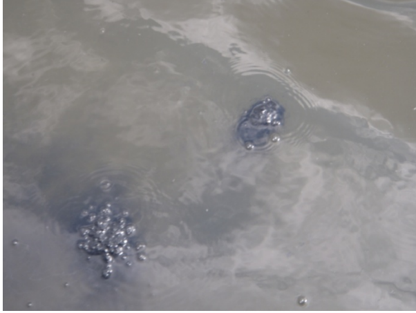
Figure 6. Rouge River Sediment Globs, 8-9-11.