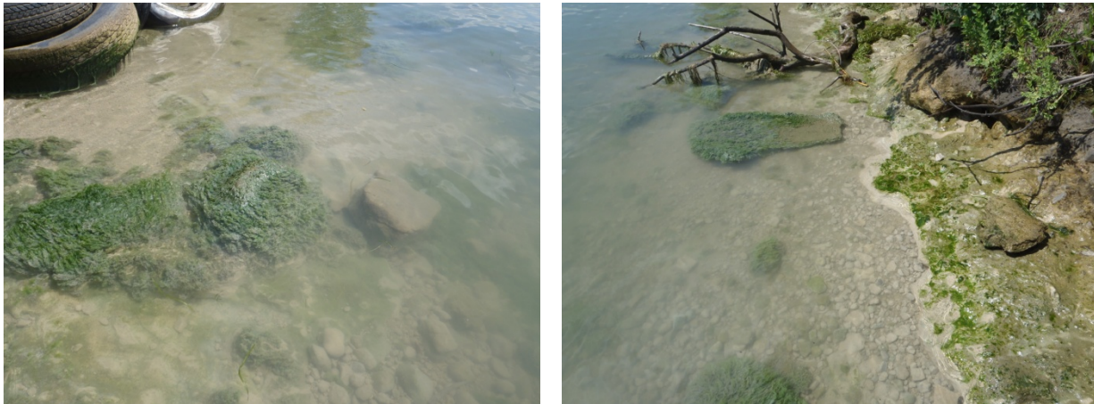
Figures 7 & 8. Detroit River Shoreline Adjacent to US Steel Slag Operation.

Without performing a biosurvey, it is not clear whether the aquatic life designated use may be impaired at this location. However, based on the pH level and calcified deposits observed during the aesthetics assessment, DEQ staff conclude that the aesthetics beneficial use in the Detroit River remains impaired.