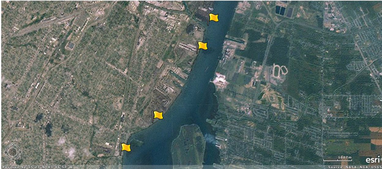
Figure 8. Detroit River Aesthetics Monitoring Locations.