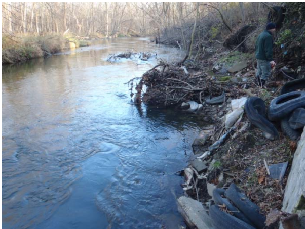
Figure 3. St. Lawrence Cemetery Property, 11-16-11

During the November 16, 2011 assessment, additional photographs of the landfill area were taken showing a six to eight foot vertical wall of landfill debris sloughing into the river (Figure 3). The debris found in the immediate area included: car bodies, a transmission, a motorcycle frame, a clothes dryer, scores of tires, glass bottles, plastic toys, bicycle parts, plastic bags, wood debris, and other various forms of trash. In terms of water quality, discolored water was observed seeping out of the exposed river bank and into the river (Figure 4). However, surface samples of river water that were collected adjacent to the site did not exhibit unnatural color, but petroleum odors were present, as were oily sheens and biofilms.