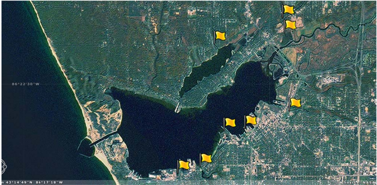
Figure 1. Muskegon Lake Aesthetics Monitoring Locations.