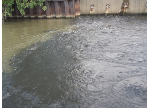
Figure 7. Rouge River DWSD Outfall #050, 8-9-11.