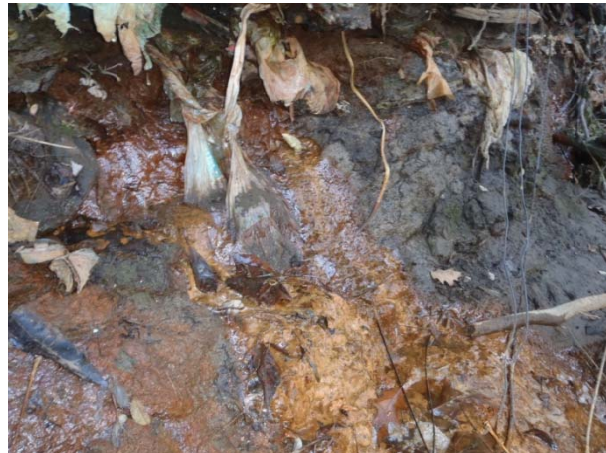
Figure 4. Landfill Leachate, 11-16-11

The site was immediately referred to the DEQ's Water Resources Division and Remediation Division for further investigation and follow up. On September 1, 2011, water and sediment samples were collected from the site for analysis. The water samples exceeded aquatic life values developed for both mercury and copper. The sediment samples did not exceed available screening value concentrations. A meeting has been scheduled with the landowners, regulatory authorities and other stakeholders to begin the process of determining how best to proceed with site remediation. It is the professional opinion of AOC program staff that due to ongoing, persistent conditions at the St. Lawrence Cemetery site immediately adjacent to the Clinton River, the aesthetics beneficial use in the Clinton River AOC remains impaired.